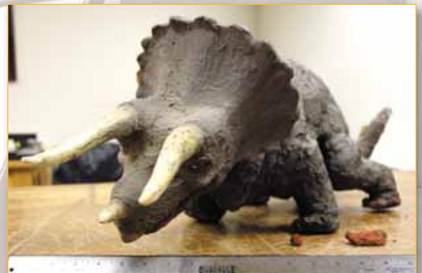
The triceratops from the Samuel A. Peeples Collection.

The model was first used in an uncompleted 1931 film titled Creation . The stop action footage for this movie was then used in King Kong . However, the triceratops was edited from the finished version of the 1933 movie, although the original Creation test footage can be found on the R1 King Kong DVD released by Time-Warner in 2005. The exhibit discusses the technique of stop-motion photography and that the triceratops is Wyoming’s state dinosaur. ■