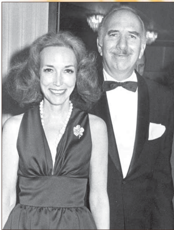
David and Helen Gurley Brown. David Brown Papers.

Hollywood film producer David Brown, whose papers are held by the AHC, recently passed away at the age of 93. Born in 1916 in New York City, Brown received degrees from Stanford University and Columbia University during the 1930s. During World War II he served as a first lieutenant in the psychological warfare section of U.S. military intelligence. After the war he became a fiction editor, serving as editor for Liberty magazine and eventually serving as managing editor of Cosmopolitan magazine. In 1951 he accepted the position as head of the story department at film studio Twentieth Century Fox. Brown left the financially strapped studio during the early 1960s.