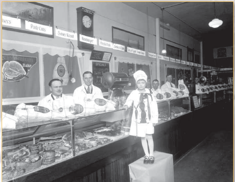
Employees of Laramie's Piggly Wiggly store on 2nd Street, take time to pose for Henning Svenson in 1929.

The Cultural Trust Fund grant in the amount of twenty thousand dollars allowed the AHC to digitize 3,916 of the most notable images in the collection and preserve 2,500 of the negatives by duplicating them