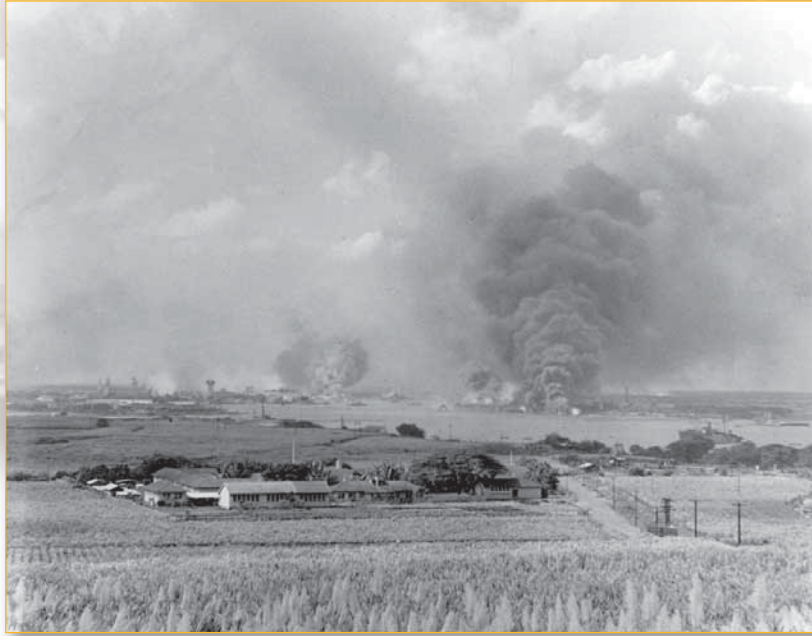
Photograph of the Japanese attack on Pearl Harbor, December 7, 1941.

Daunt received a check for $500 for the award, which is funded entirely by AHC staff and faculty. ■