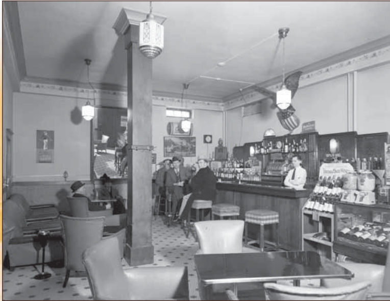
Patrons at Laramie's Connor Hotel bar enjoy a late morning drink.

the Ludwig-Svenson Studio Collection and impressed by the searching capability of LUNA. ■